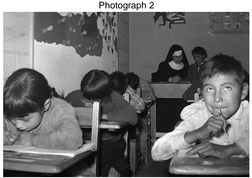
A young boy with other students and a nun in a classroom at the Pukatawagan Indian Residential School, Manitoba, circa 1960.