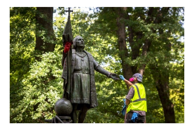
A worker removing the red paint from the hand of a Christopher Columbus statue in Central Park in September 2017.

You have read the following comments on social media about the defacing of this statue. Which one do you agree with? Why?