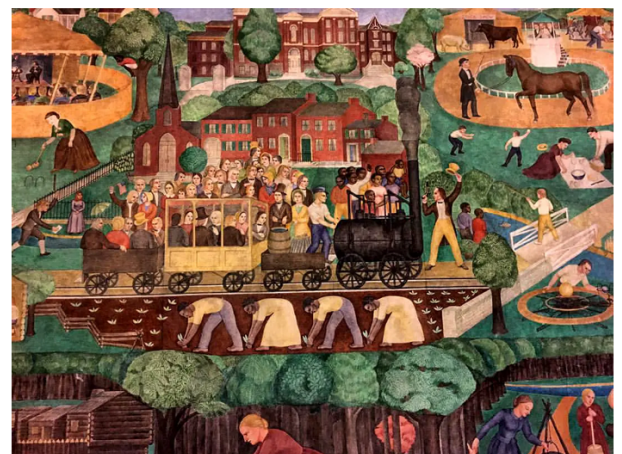
The fresco at the University of Kentucky