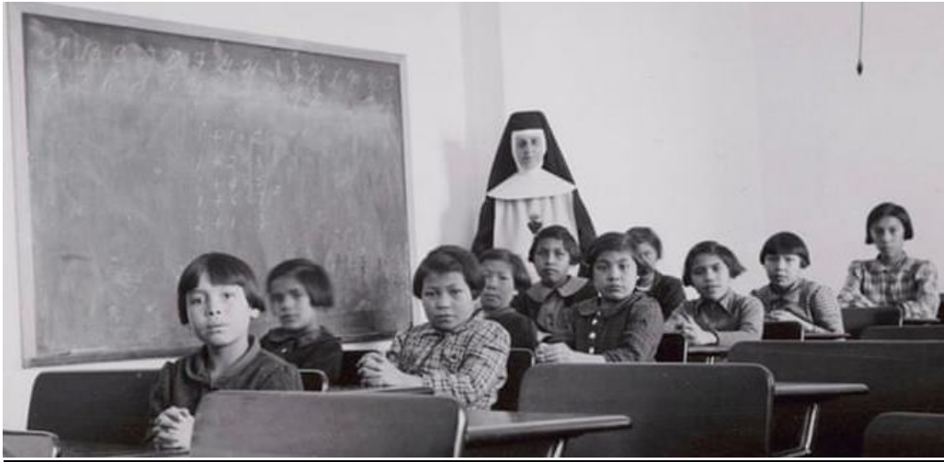
Female students and a nun pose in a classroom at Cross Lake Indian Residential School, Manitoba, February 1940 (Indian and Northern Affairs/Library and Archives Canada).