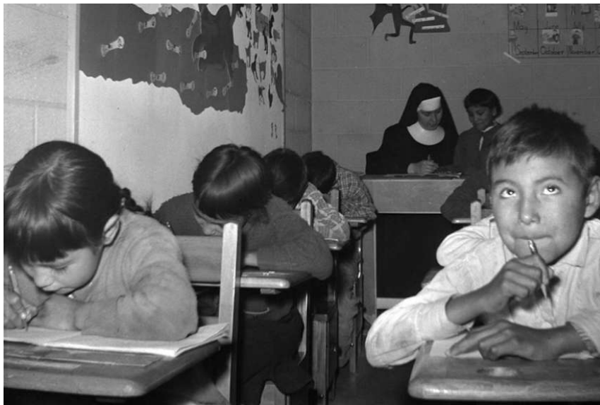
A young boy with other students and a nun in a classroom at the Pukatawagan Indian Residential School, Manitoba, circa 1960.